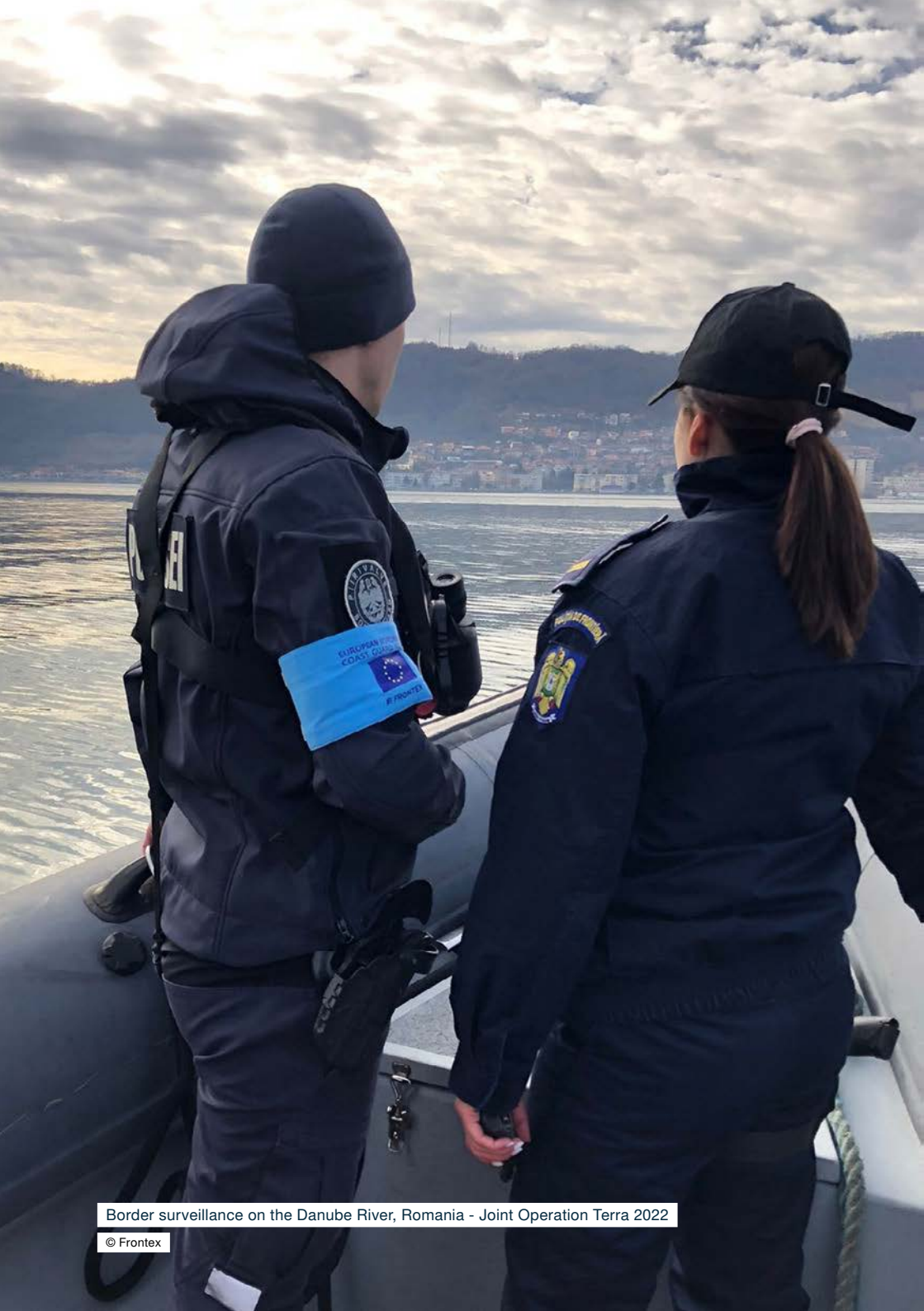
Border surveillance on the Danube River, Romania - Joint Operation Terra 2022