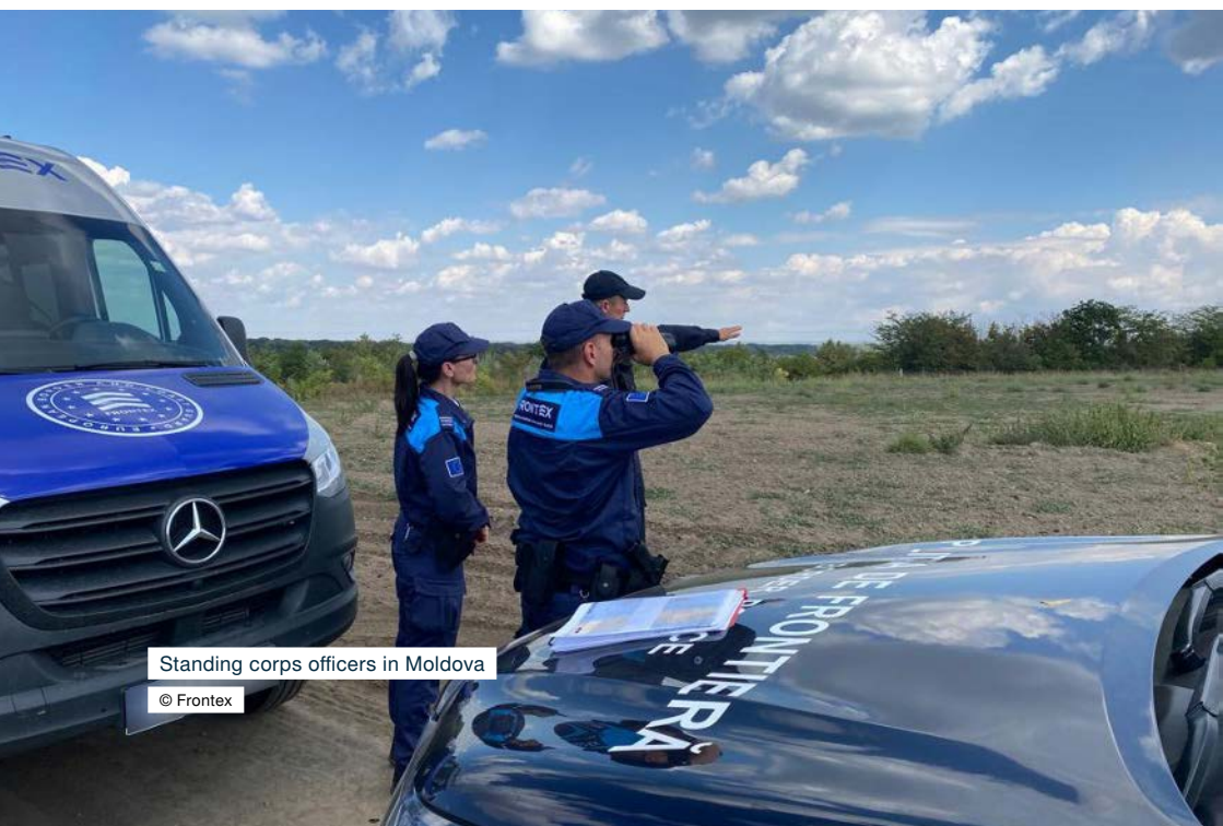
Standing corps officers in Moldova