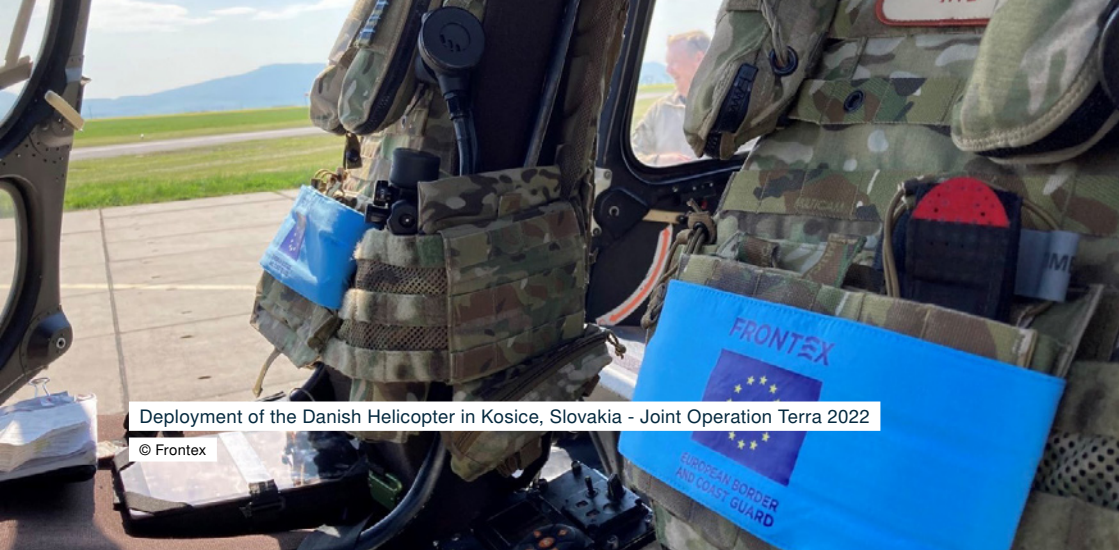
Deployment of the Danish Helicopter in Kosice, Slovakia - Joint Operation Terra 2022