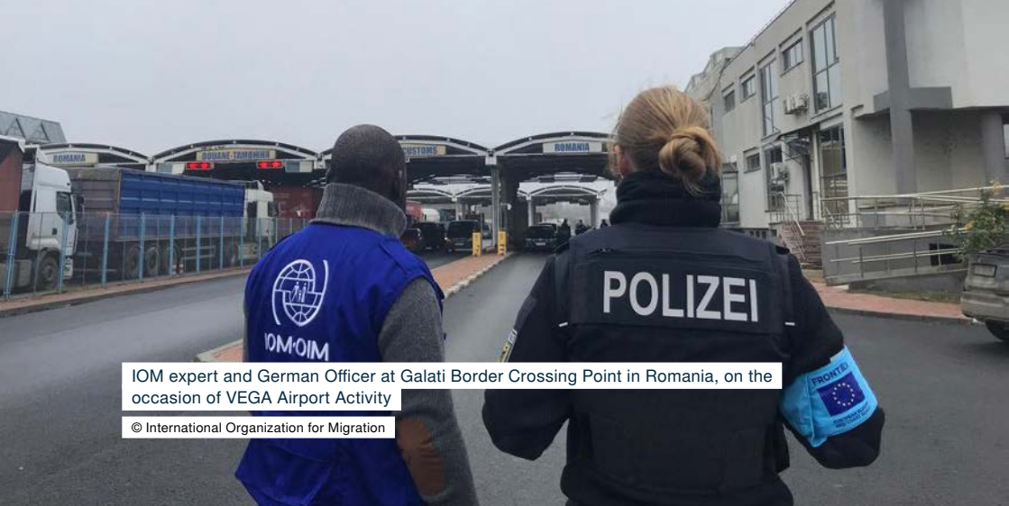
IOM expert and German Officer at Galati Border Crossing Point in Romania, on the occasion of VEGA Airport Activity