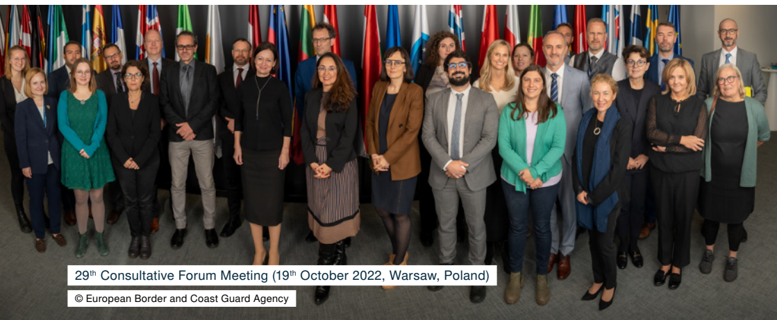
29 th Consultative Forum Meeting (19 th October 2022, Warsaw, Poland)

© European Border and Coast Guard Agency