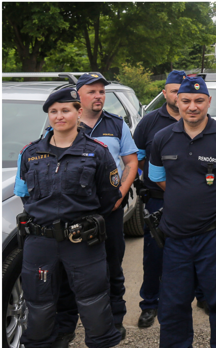
Officers deployed to the Joint Operation Serbia – Land

As part of the Agency's strategy to further strengthen the cooperation with countries outside the EU and following Frontex Management Board approval, Serbia was a destination to deploy the first Frontex liaison officer in the Western Balkans, who took up her duties in 2017. She is based in Belgrade and covers three countries of the region, i.e. Bosnia and Herzegovina, Montenegro and Serbia.