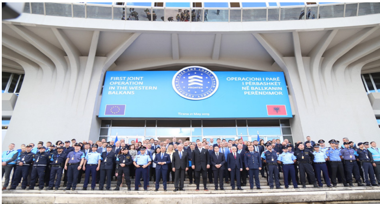
Launch of the first Joint Operation in the Western Balkans in Tirana, Albania

The Security Academy in Tirana became the first Western Balkan associate partner of Frontex Partnership Academies Network in January 2018. Being a member of the Partnership Academies network familiarises the Albanian authorities with the working practice of other partnership academies, paving the way for the development of cooperation in the field of border and coast guard training; it also allows Albania to fully benefit from the targeted training offer. Following the entry into force of the EU Status Agreement, in May 2019, Albania is the first Western Balkan country to participate in the training courses for Border Surveillance Officers for land operations and Frontex