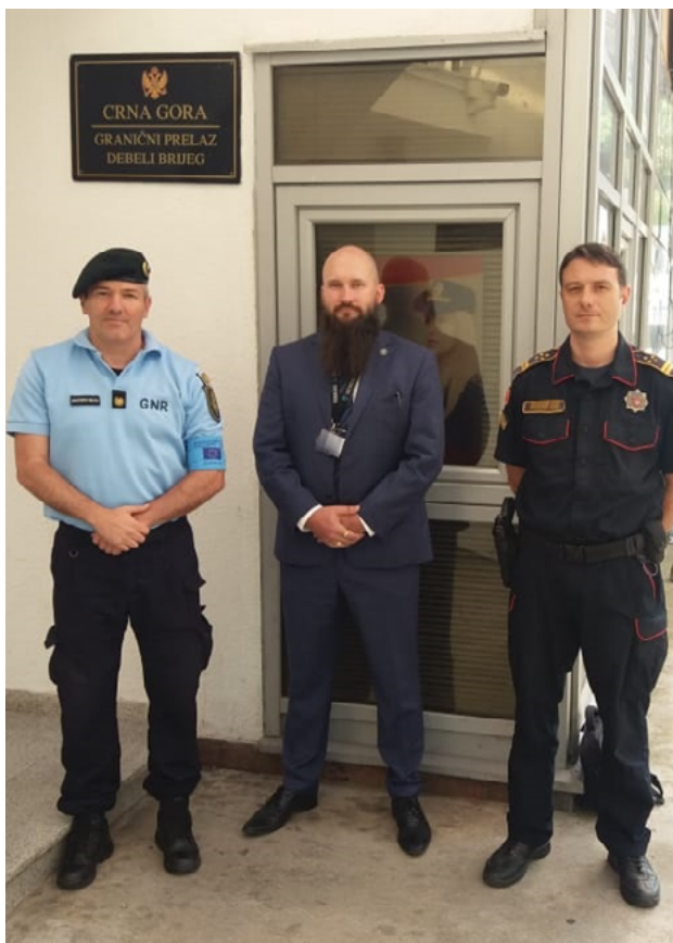
JO Montenegro 2020 - Focal Point Debeli Brijeg

nonetheless, thanks to the high level of commitment and cooperation reached between the Agency, Montenegro and the participating Member States in overcoming any operational and logistical challenges and reaching the operational objectives. Following the success of the operation at the land border, in October 2020 Frontex launched activities at sea in Montenegro. The main focus of this operation is on smuggling of drugs, weapons, illicit or excise goods and stolen boats from the Western Balkan region toward the EU.