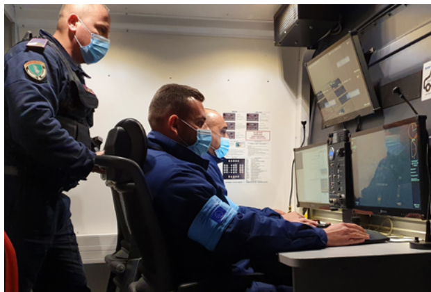
A people smuggling ring was dismantled thanks to cooperation between Albanian authorities and Frontex

The Security Academy in Tirana became the first Western Balkan associate partner of Frontex Partnership Academies Network in January 2018. Being a member of the Partnership Academies network familiarises the Albanian authorities with the working practice of other partnership academies, paving the way for the development of cooperation in the field of border and coast guard training; it also allows Albania to fully benefit from the targeted training offer. Following the entry into force of the EU Status Agreement, in May 2019, Albania is the first Western Balkan country to participate in the training courses for Border Surveillance Officers for land operations and Frontex