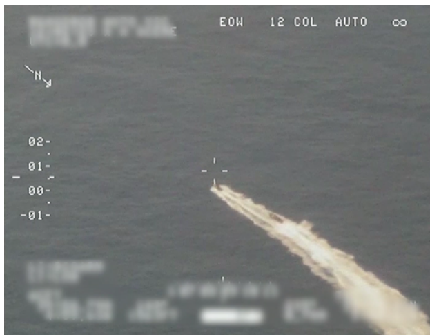
Maritime operation in Montenegro

At the request of the European Commission in 2018, Frontex has assessed the “financial resources for the implementation of the Emergency Measures Action Plan to Combat Illegal Migration”, put forward by the Bosnia and Herzegovina authorities in the context of the increased migratory pressure at Bosnia and Herzegovina borders. The Emergency Action Plan was developed and included a set of proposed measures to be urgently adopted to strengthen irregular migration management and border control. As an immediate action to increase the registration capacity in Bosnia and Herzegovina, especially in the locations identified as most critical from the perspective of the migratory pressure and existing infrastructure, Frontex assessed that it can directly support Bosnia and Herzegovina’s Ministry of Security through purchase and